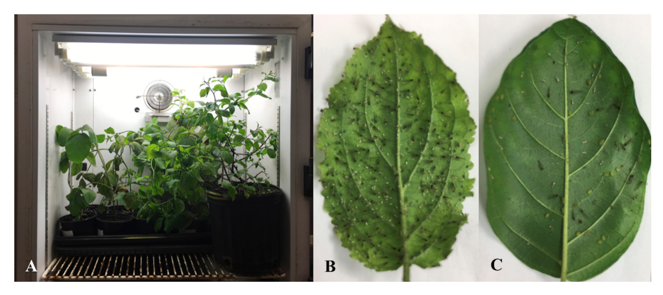
Figure 1. Plant tissue-culture growth chamber Percival. A ) Soybean plants maintained in a plant growth chamber for 21 days before placed Rhamnus cathartica . B ) Leaf of R. cathartica infested with soybean aphid biotype 1. C ) Leaf of Frangula alnus with soybean aphid biotype 4.

these numbers were summed to represent a total count. A second evaluation was performed 21 days later by randomly sampling and removing 15 leaves and 15 buds to count the number of adult oviparae and eggs, respectively. A similar procedure was performed for each biotype on each host by using two identical plant growth chambers (Percival, TC-2) to house the two overwintering hosts, so that one biotype was tested during one time period. When one biotype of the experiment was complete (testing one biotype on both overwintering hosts), another biotype was completed with the same conditions as previously stated for the first biotype. In between testing biotypes, each growth chamber was turned off, cleaned up, and then turned on at a temperature set to 40°C for 2–3 days to kill any remaining aphids. All four biotypes of soybean aphids were tested sequentially in this manner. The entire process with the four biotypes was repeated and referred to as run 1 and run 2. Sampling protocol for each biotype against each host was the same for each run with one exception: for run one, the number of adult oviparae was not counted for biotype 4 on common buckthorn for the second evaluation. To determine if the number of aphid morphs produced by each biotype were different on common buckthorn and glossy buckthorn, a chi-square calculator was used to determine the goodness of fit at a significance of P < 0.05 (socscistatistics.com).