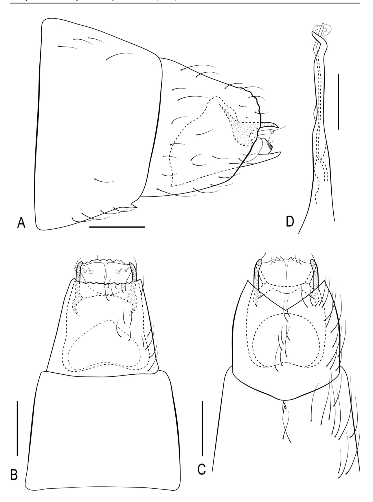
Fig. 2. Oxyethira ( Trichoglene ) rectangulata sp. nov., male genitalia. A . Lateral. B . Dorsal. C . Ventral. D . Aedeagus, dorsal. Scale bars = 0.1 mm.