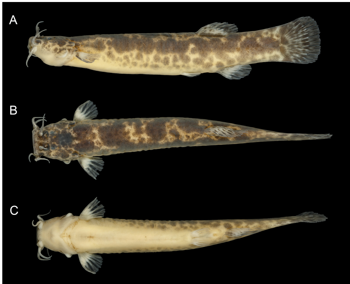
Fig. 5. Cambeva betabelardense sp. nov., holotype (UFRJ 6995), 42.7 mm SL. A. Left lateral view. B. Dorsal view. C. Ventral view.