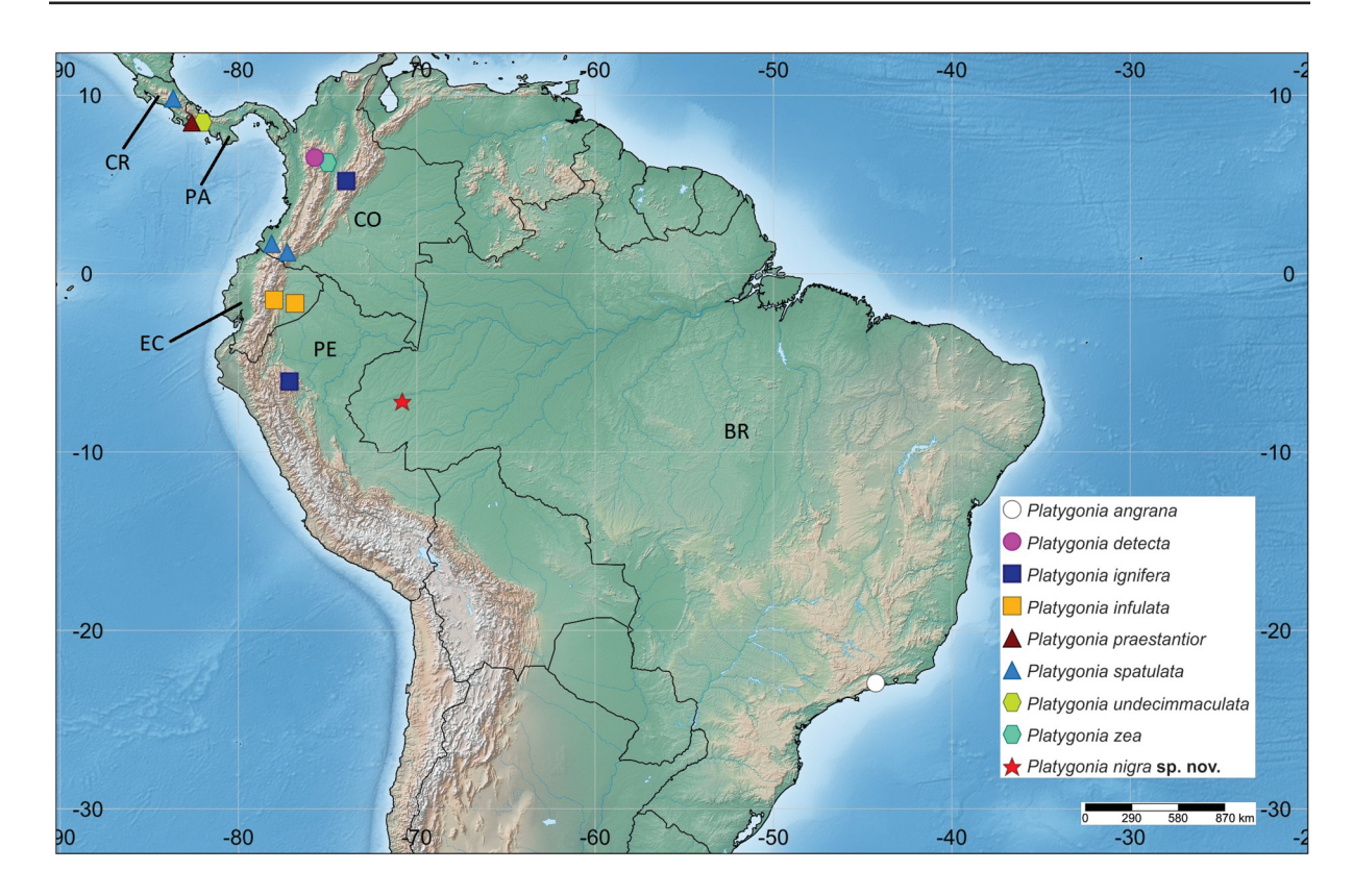
Fig. 9. Known distribution of species of Platygonia Melichar, 1925. Countries: BR = Brazil; CO = Colombia; CR = Costa Rica; EC = Ecuador; PA = Panama; PE = Peru.

This paper, along with other publications on the taxonomy of the tribes Cicadellini and Proconiini (e.g., Cavichioli & Mejdalani 2012; Silva et al. 2017, and Pecly et al. 2019), reveals that the fauna of the Cicadellinae from the Neotropical Region, especially that from the Amazon Rainforest, is still poorly known. The greater concentration of leafhopper taxonomists in Southeastern and Southern Brazil, in comparison with other regions of the country, is possibly an explanation for this problem, as well as the great difficulties for accessing various collection sites in the Amazon region. Studies of material in backlogs of scientific collections, as well as the conduction of field work in various parts of the Amazon region, will certainly result in the discovery of new interesting species and genera of the Cicadellinae and other leafhopper subfamilies.