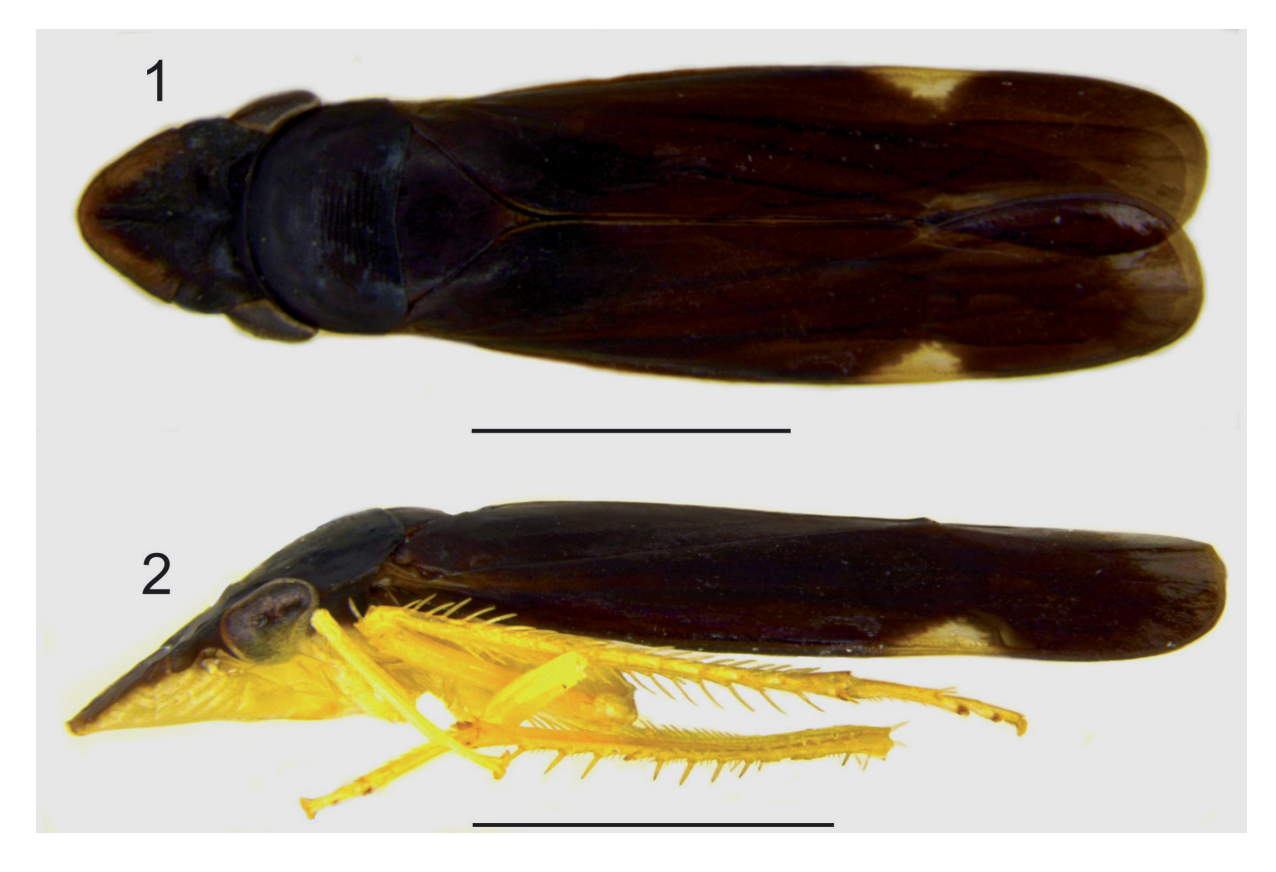
Figs 1–2. Platygonia nigra sp. nov., holotype, ♂ (INPA). 1 . Body, dorsal view. 2 . Body, lateral view. Scale bars = 2 mm.

Head (Figs 1–2). In dorsal view, strongly produced anteriorly; median length of crown greater than interocular width and about $\frac{8}{10}$ transocular width; anterior margin narrowly rounded; with distinct carina at transition from crown to face; ocelli located slightly before transverse imaginary line between anterior eye angles, each ocellus slightly closer to median line of crown than to adjacent anterior eye angle; disk depressed from ocelli to apex; with inconspicuous median longitudinal fovea; frontogenal suture extending onto crown and attaining ocellus. Antennal ledge, in dorsal view, slightly protuberant; in lateral view, with anterior margin oblique. Face with disk of frons depressed medially; muscle impressions distinct. Clypeus with profile continuing contour of frons.