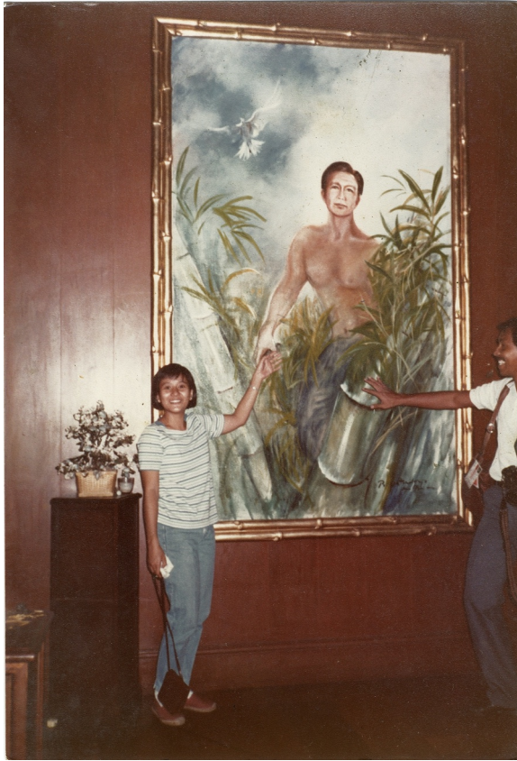
Figure 1. Photograph taken on 25 February 1986 in the Marcoses' private chambers at Malacañan Palace (1986).

collection accessible to the public by recreating this inventory using different strategies of reconstruction.