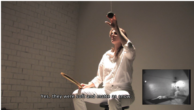
Figure 2. Malin Arnell, still from video documentation of Reflect Soft Matte Discourse , 2011, combined with a video still from Gina Pane's performance Discours mou et mat , 1975.

asserted that her attitude was 'absolutely not autobiographical'. 7 By using Gina Pane's instructions, I am firmly asserting that my attitude is autobiographical (but not authentic). Is that possible?