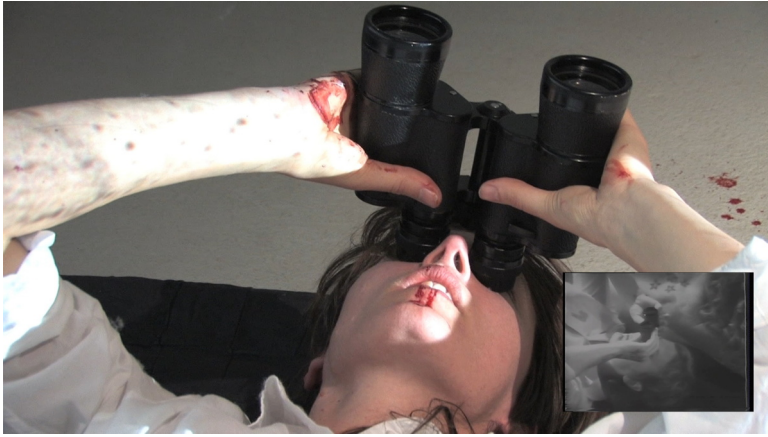
Figure 3. Malin Arnell, still from video documentation of Reflect Soft Matte Discourse , 2011, combined with a video still from Gina Pane's performance Discours mou et mat , 1975.

Then, in 1975: I was five years old. I was hiding in the woods, making up my own reality. Out there was the New Left, the Black Power movement, the war in Vietnam, the African independence movements, gay liberation movement, the situationist movement, the May 1968 revolt in Paris, the French structuralist feminism movement. Monique Wittig published Les Guérillères and Le Corps Lesbien (translated as The Lesbian Body ).