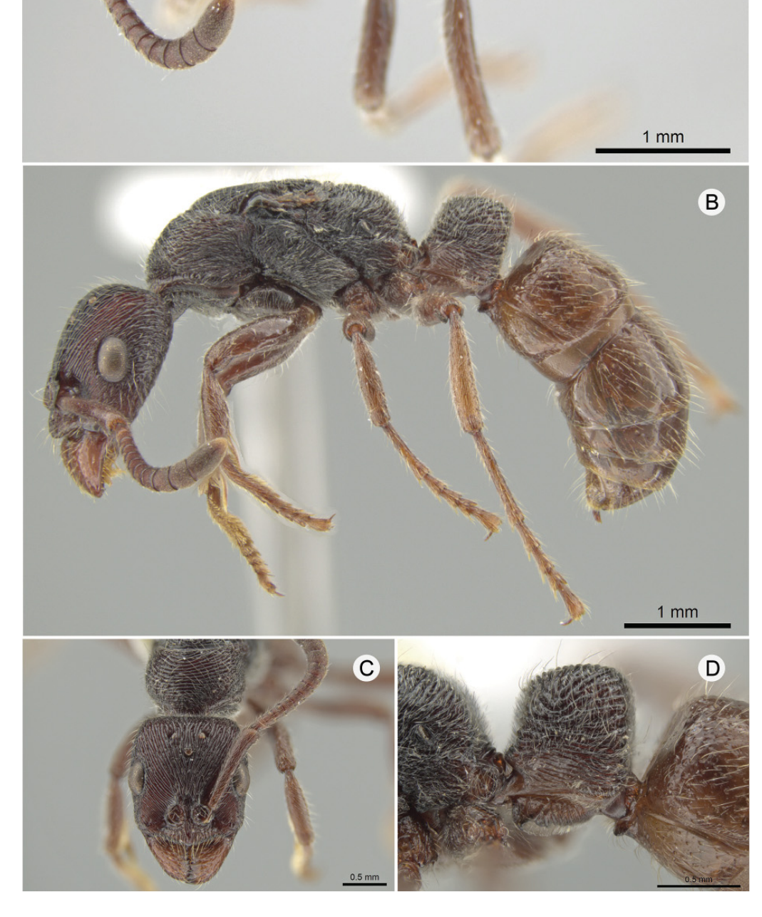
Fig. 3 . Igaponera curiosa (Mackay & Mackay, 2010), holotype queen. A . Body in dorsal view. B . Body in lateral view. C . Head in frontal view. D . Petiole in lateral view. Additional images available on AntWeb (www.antweb.org). Scale bars: A-B = 1 mm; C-D = 0.5 mm.