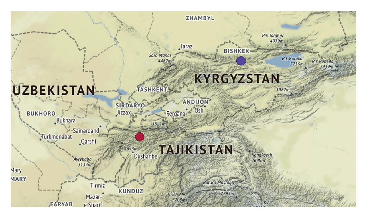
Fig. 2. Distribution map showing the type localities of Quedius gissaricus sp. nov. (red circle) and Q. viator sp. nov. (violet circle).

Measurements and ratios. HL: 1.25; HW: 1.39; PL: 1.5; PW: 1.68; EL: 2.02; EW: 1.93; FB: 4.75; TL: 8.84; HL/HW: 0.90; PL/PW: 0.88; EL/EW: 1.05; PL/EL: 0.73; PW/EW: 0.87.