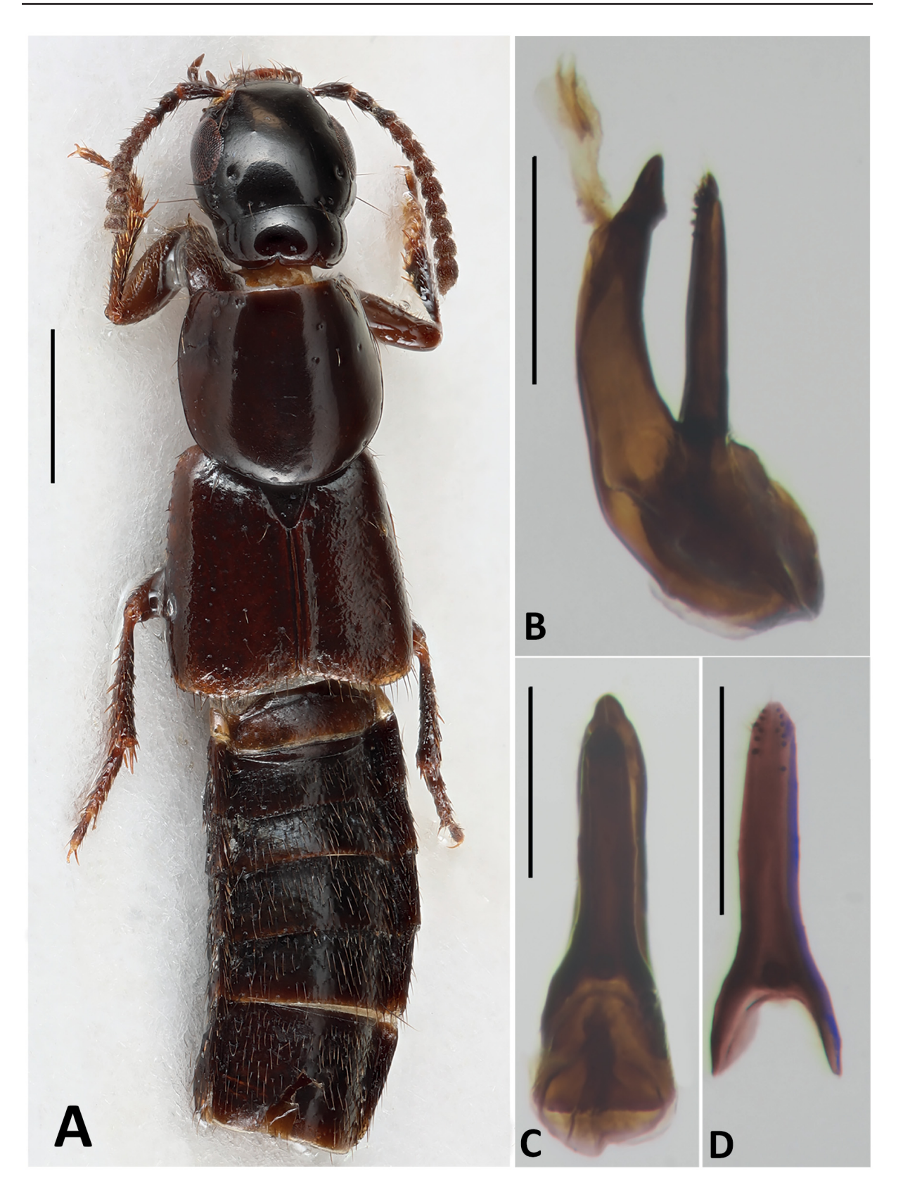
Fig. 4. Quedius sp. aff. gissaricus (ZIN). A. Habitus. B–D . Aedeagus. B. Lateral view. C. From parameral side. D. Paramere (underside). Scale bars: A = 1 mm; B-D = 0.5 mm.