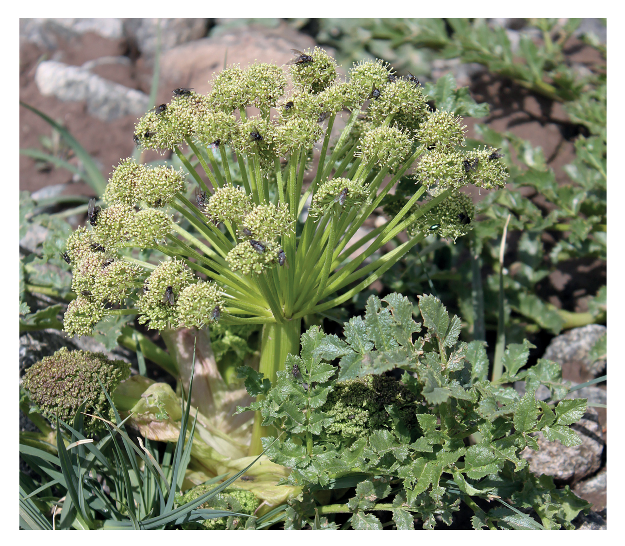
Fig. 2. Angelica brevicaulis (Rupr.) covered with muscoid flies at Kalmak-Anshun Pass, Kyrgyzstan.

Specimens were examined using an Altami PSO745-T microscope for external morphological features. Illustrations were made with a Canon EOS 600D camera mounted on a Zeiss Stemi 2000-C stereo microscope and processed using Adobe Photoshop CS.