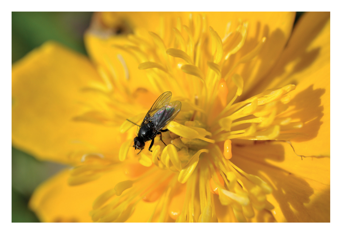
Fig. 1. Drymeia sp., ♀.