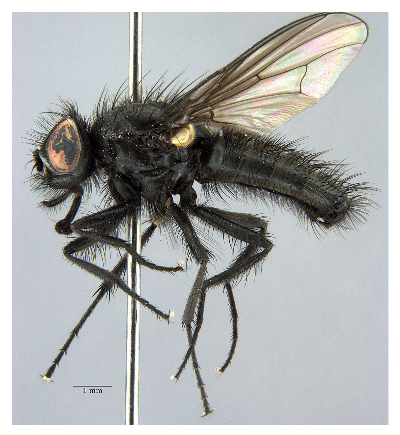
Fig. 4. Drymeia ziegleri sp. nov., ♂, holotype (ZMHU), lateral view.