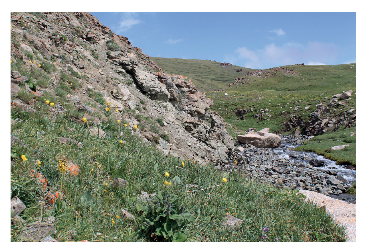
Fig. 5. The type-locality of Drymeia ziegleri sp. nov. (Kyrgyzstan, Kalmak-Anshun Pass).

HEAD. Ground-colour black. Eye densely long-haired. Fronto-orbital plate and parafacial, face, gena and lower occiput brownish-grey pruinose. Fronto-orbital plates not touching, separated by a narrow frontal vitta. Frons at narrowest point 3 \times as wide as diameter of anterior ocellus. 16–18 pairs of frontal setae, including interstitials, reaching almost to anterior ocellus. Antenna black, postpedicel 1.5 \times as long as wide. Arista appearing almost bare, longest hairs much shorter than its basal diameter. Parafacial at level of insertion of arista slightly wider than or equal to width of postpedicel, hardly narrowing below. In lateral view, lower facial margin not projecting forward beyond level of antennal base. Gena broad,