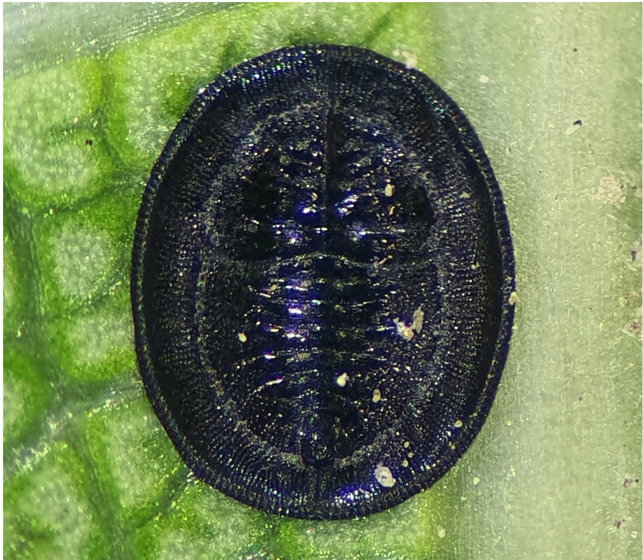
Figure 1. Aleuoparadoxus marisae sp. nov. puparium on a leaf of Brosimum alicastrum .

Type material. Holotype puparium. Guatemala: Petén, Santa Ana, puparium on Brosimum alicastrum , 11.VI.2018, 16.808315° N, 89.827173° W, Col. José García, (deposited in the UVGC). Paratypes: 10 puparia, 5 puparia on 5 slides, data as the holotype (deposited in the UVGC); 2 puparia on 2 slides, data as the holotype (deposited in the USNM); 2 puparia on 2 slides, same information except collection date, 7.VII.2021; 1 puparium