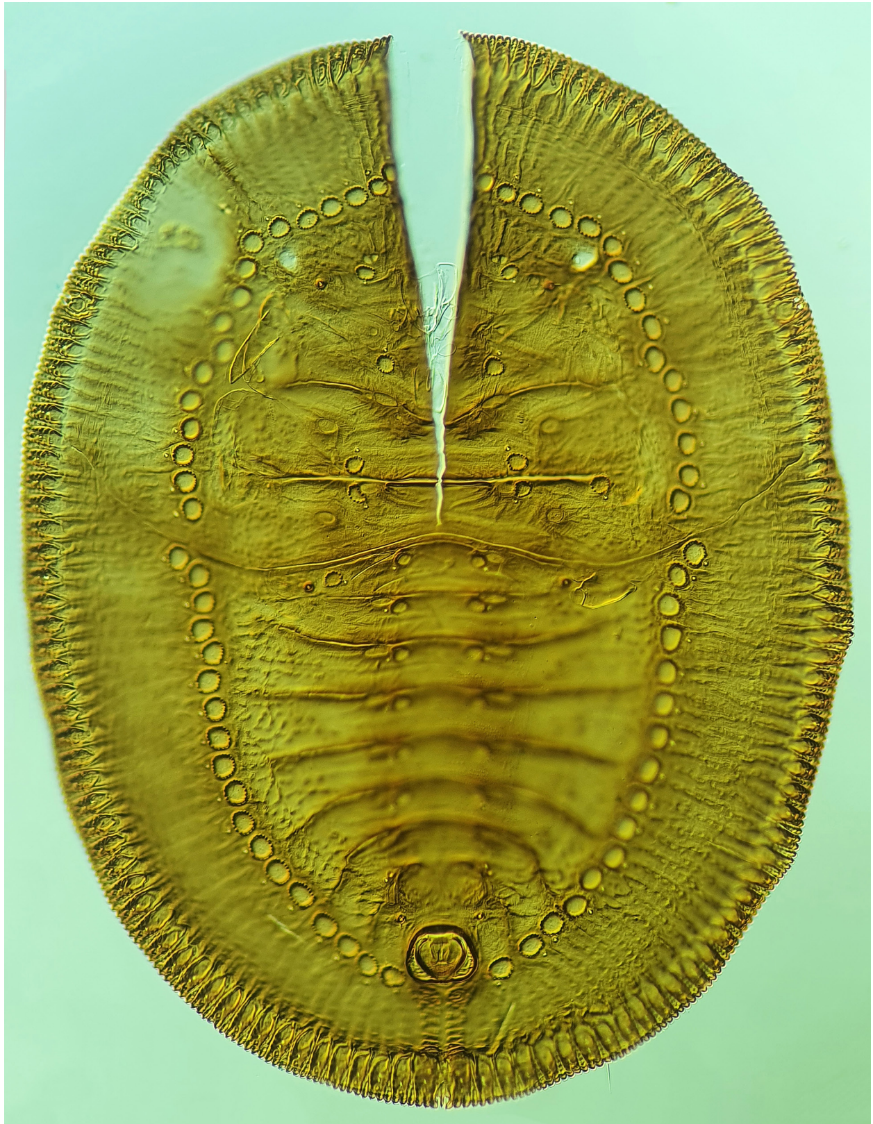
Figure 3. Aleuoparadoxus marisae sp. nov., pupal holotype on slide.