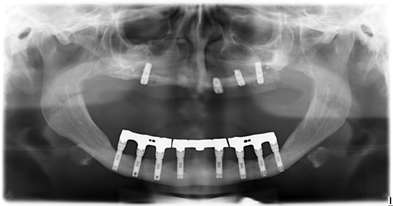
Figure 1. Patient 3 (panoramic radiograph performed in 2008): Eight hollow-screw implants (mandible) inserted in 1992 (16 years in situ); Four Astra® implants (maxilla) inserted in 2008 (six months in situ), two implants (maxilla) have already been lost.

In Patients 3 (see Figure 1), 4, and 5, implants were primarily inserted years before in different private practices (for details, see Table 1).