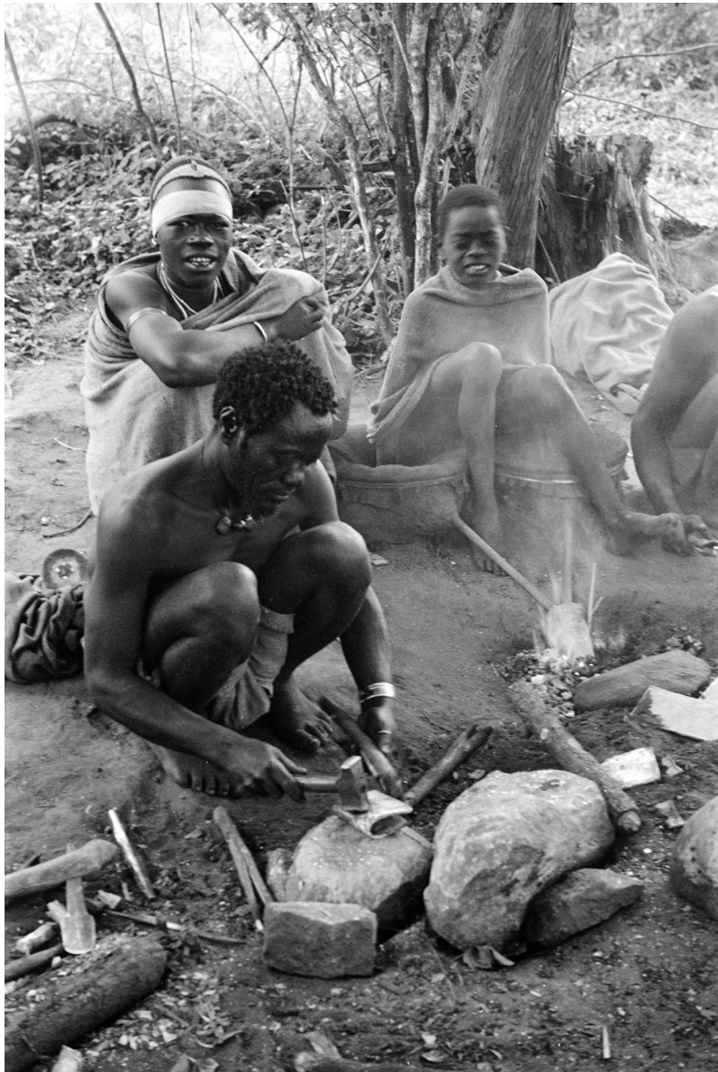
Fig. 2: "potter in Woleyta, 1967"