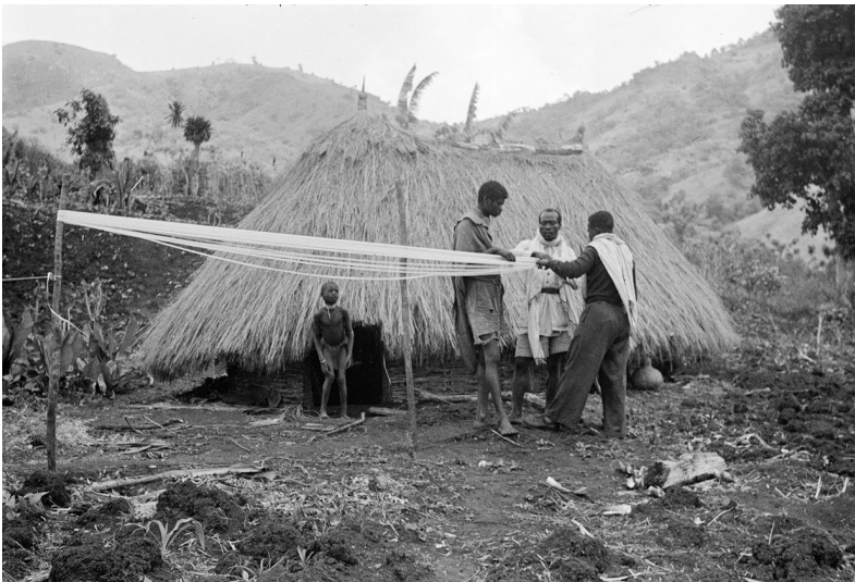
Fig. 1: "weaver in Baka, 1950–52"

In most Ethiopian societies a clear distinction is made between craft workers and farmers. In some places, craft workers engage in several crafts and also in trading. Most craft workers are considered to be unclean and polluting and are, thus, avoided. However, not all crafts are considered equally polluting. Potters and blacksmiths, for example, are among the most commonly despised along with, in many places, tanners and weavers. Rules of endogamy and avoidance do not only exist between farmers and craft workers, but also among the various craft workers themselves, as well as towards hunters and slave descendants (see Jensen 1959; Haberland 1963; Freeman and Pankhurst 2001). Eating together, sometimes entering each others' houses, touching each others' objects or bodies and, in most cases, intermarriage are forbidden. In the literature on Ethiopia, the peoples most commonly known for this behaviour are the Hadicho in Woleyta (Aalen 2011), the Manni in Ari (Jensen 1959; Schulz-Weidner 1959; Straube 1963), the