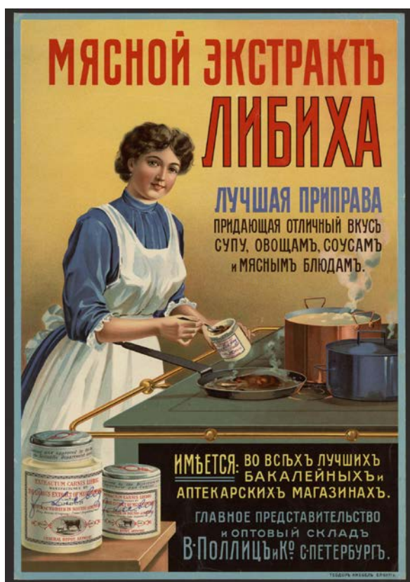
Fig. 1: A Russian-language trade card for Liebig's Meat Extract: «Liebig's Meat Extract: the best seasoning that gives an outstanding taste to soup, vegetables, sauces, and meat dishes».

In addition to his research on agriculture and plant nutrition, Liebig worked on the issues of animal chemistry, shaping the public understanding of nutrition, diet, and health. He even publicized a method of producing meat extract and lent his name to the commercial product, which was marketed with illustrated trade cards that are collectors' items today. (see fig. 1 4 )