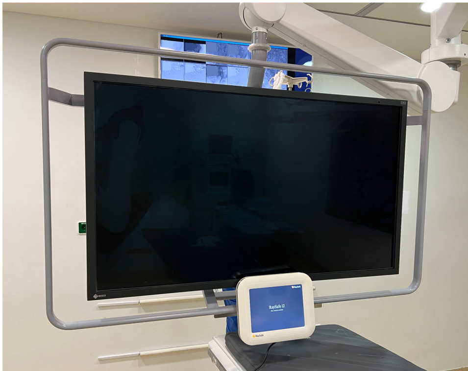
FIGURE 5 The real-time display was attached to a height-adjustable rod, which in turn could be mounted on the angiography table via a rail system.