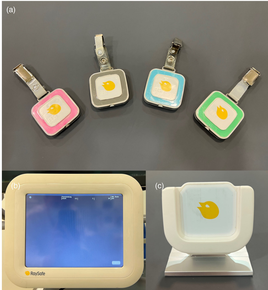
FIGURE 1 Measurement of radiation exposure (mSv/h) using a direct dosimeter system (Unfors RaySafe GmbH, Ulm, Germany) with real-time visual feedback, consisting of dosimeters in different colors (A), a real-time display (B), and a cradle (C). Abbreviations: mSv, millisievert. \mu Sv, mikrosievert.

changes in behaviour from changes that might be mainly attributable to the use of live-screen dosimetry, a total of 30 interventions that were performed with and without initial training regarding radiation dose savings and correct behaviour were additionally analyzed. The training was achieved by refreshing useful methods that aim at keeping radiation exposure as low as reasonably achievable. For this purpose, an experienced senior interventionalist with 19 years of experience in interventions (K.E.) gave clear instructions in radiation dose protection to primary investigators, each of them completing a 30-min refresher course. The lecture included the use of table-side shields (equipment-related variables), keeping sufficient distance to the x-ray tube (operator-related variables), and technical