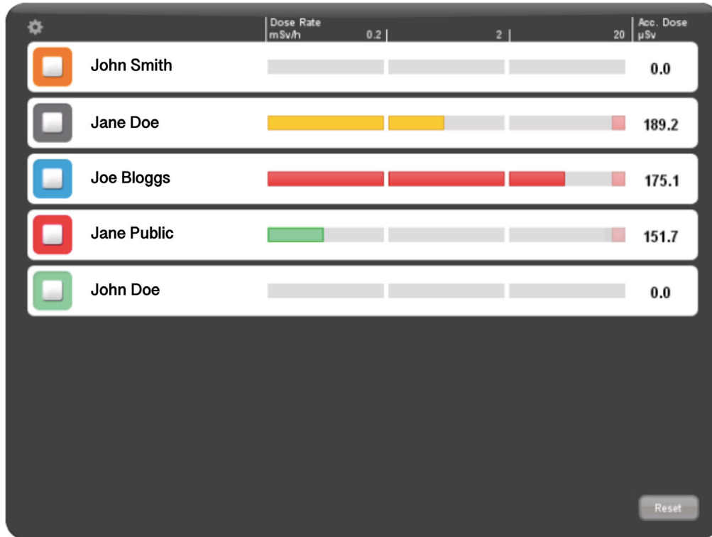
FIGURE 4 Screenshot of the RaySafe real-time display visualizing the accumulated radiation dose using color-coded bar graphs. Green, yellow, and red bars indicate the dose rate for the five participating individuals. Abbreviations: Acc. Dose, accumulated dose. mSv, millisievert. \mu Sv, mikrosievert.