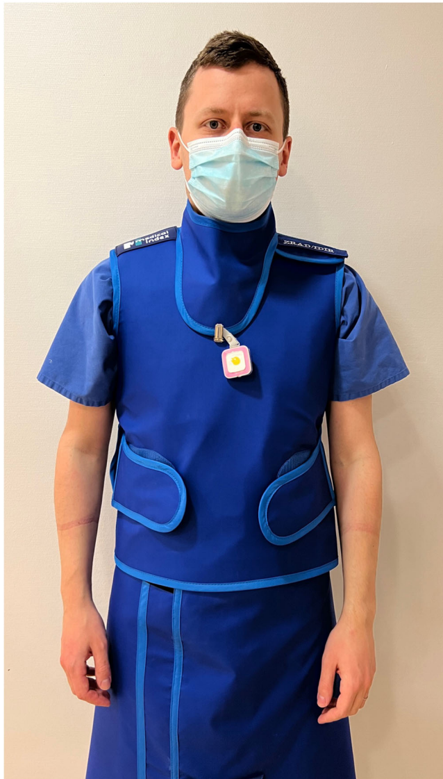
FIGURE 3 The dosimeter was worn by the interventionalist at chest height over the lead protection, communicating wirelessly with the real-time display via a radio link. Communication was secured up to a distance of 10 m.

rapid overview of all dosimeters currently in use providing the ID and name of the RSD, the accumulated dose, the remaining memory place, and the battery status.