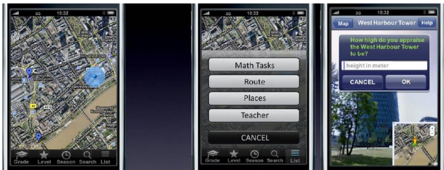
Figure 2: MCM-app test version

In the MCM-portal the user can also participate actively (co-author user, Fig. 1) in the project. On the one hand, one has the possibility to create one’s own tasks and deliver them to the math problem database. On the other hand, one can rate math problems from other users to ensure the quality. This portal is accessible to students/teachers from the Internet via computer as well as via smartphone and the MCM-related app.