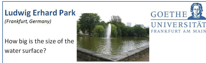
Figure 3: Example problem “Ludwig Erhard park“