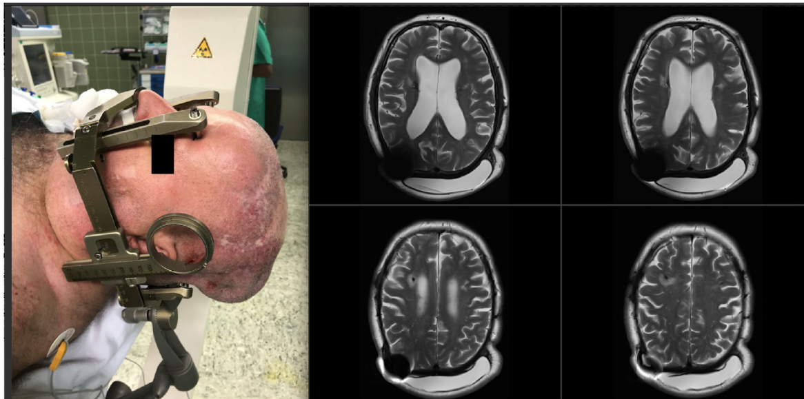
Illustration 1. Considerations regarding TE-positioning and placement of the stereotactic frame.