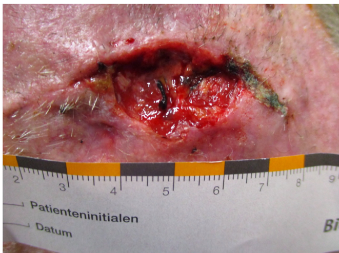
Image1. Scalp Defect with underlying DBS leads.

Since we used the Leksell coordinate frame G, attention was given to leave ample room to place pins for lateral mounting following the centre of the arc principle (Zrinzo, 2012), without puncturing or hindering the removal of the TE (Illustration 1). Close communication with the oral-cranio-maxillofacial surgeon at this planning step was a priority. A member of our neurosurgical team was present during the implantation of the TE. Specific attention was given to highest possible MRI-compatibility and placement of the TE for the purposes of the eventual re-implantation. The manufacturer of the TE was contacted to ascertain the materials utilized and the method used in production. External MRI Safety data was unfortunately not available.