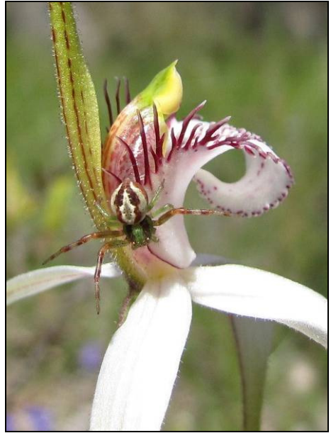
Crab spider (Thomisidae) waiting on an orchid near Kojonup, Western Australia.

These images, supplied by Sue O’Halloran, show crab spiders (family Thomisidae) waiting for prey on Western Australian orchids during the Spring wildflower season. These photos were taken at Farrar Railway Dam Reserve, west of Kojonup, and highlight the problems male flower wasps encounter while trying to find and mate with females. Many of these orchid species engage male flower wasps as pollination vectors, by duping them into thinking the flowers are themselves female wasps. Male flower wasps arrive at such flowers and try to mate with the orchids, only to receive a pollen packet in return. The second and third photos (below) show a male flower wasp that has not only been duped by an orchid, but also been captured by a waiting thomisid.