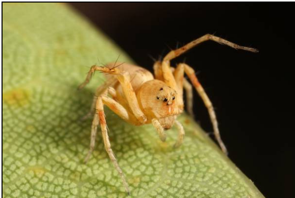
Lynx spider (Oxyopidae) from near Chillagoe Caves, Queensland.