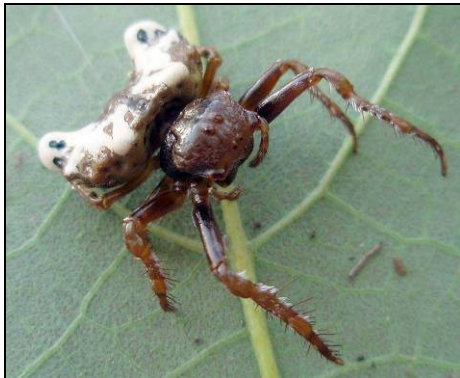
Figure 5. Arkys curtulus (Simon, 1903). Sometimes called the ‘Bird-dropping Spider’ – but not to be confused with another araneid, Celaenia excavata (L. Koch, 1867) – this medium-sized spider hunts by ambush during the day on the exposed surfaces of green leaves, with legs drawn up, waiting for prey. Resembling a bird dropping, it is extremely well camouflaged and therefore rarely noticed, but is not uncommon in eastern mainland states from Victoria’s south coast to Cape York and adjacent hinterlands. Its colours and patterns are extremely variable, ranging from brown through orange to black.