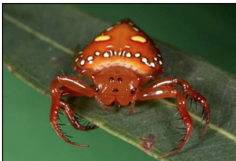
Figure 1. Arkys lancearius Walckenaer, 1837 (Triangular Spider) – the type species of the genus Arkys . This is a beautiful ambush-hunting araneid found on the leaves of green shrubs throughout Australia including Tasmania. It is identifiable by the two large, yellow, roughly circular blobs in the anterior third of the upper surface of the abdomen, which also has a series of white spots (bordered by black) all around the outside margin. This species is the most common of the genus, quite abundant in forested habitats but rarely noticed. The species name ' lancearius ' refers to a triangular spear-head or lance. Image by Greg Anderson.

Australian Arkys species are some of our most attractive and most photographed spiders, yet many still remain undescribed and as a group their biology is barely known. These spiders are in the Araneidae, an orb-weaver family, yet Arkys gave up the web snare as a strategy and took up ambush hunting. Typically, they conceal themselves amongst green foliage, often with flowers, and grab their prey with strong front legs. They may subdue the prey with a venomous bite, or wrap it in silk for later consumption (or both). In rainforests, especially in south-eastern Queensland, they are easily seen going about their business.