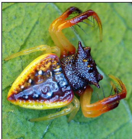
Figure 4. Arkys cornutus L. Koch, 1872 is an ambush hunter, active on foliage at night. Its species name ‘ cornutus ’ means horned, referring to the horn-like projections at the front of the cephalothorax.