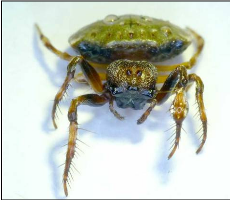
Figure 7. Arkys speechleyi (Mascord, 1968) is well camouflaged for the rainforest, the greenish abdomen heavily sclerotised and with dimples reminiscent of Dolophones species. In 1968 Mascord established Neoarchemorus with N. speechleyi as the only species, based on the shape of the carapace and abdomen, eye pattern, and spine arrangement on the legs. The genus was later synonymised with Arkys by Framenau et al. (2010).