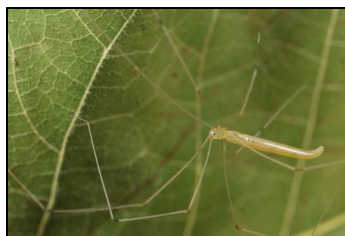
Female Micromerys gracilis Bradley, 1877 (Pholcidae) from near Darwin, Northern Territory.

These delicate, rarely seen and exquisitely camouflaged spiders live under broad green rainforest leaves in tropical eastern Queensland and the Northern Territory.