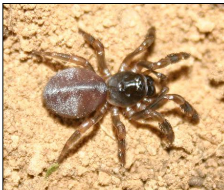
Female Moggridgea sp. from the Stirling Range National Park, Western Australia.