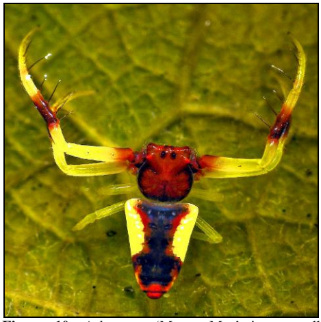
Figure 10. Arkys sp. 'Mount Mee' is a small rainforest species with bright yellow flanks on the abdomen. Rather scarce in suitable habitat in south-eastern Queensland around the Mount Mee region, but locally common in some pockets.