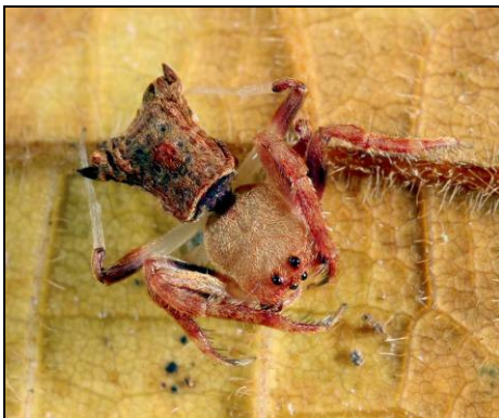
Figure 6. Arkys dilatatus (Balogh, 1978) is a small, rather nondescript ambush hunter in coastal rainforest from southern to northern Queensland. The carapace, or top of the cephalothorax, is flat and covered with pale, forward-pointing hairs. The cephalothorax is longer than wide, with more or less straight sides, very slightly wider at the rear.