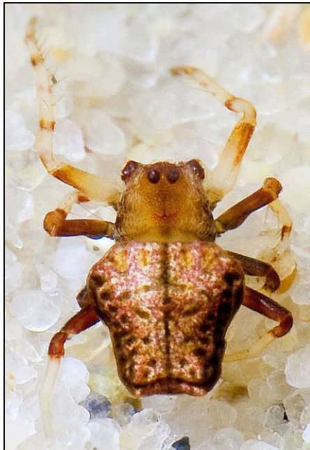
Figure 12. Arkys sp. 'Candy-coloured Arkys ' is a small, undescribed species found in subtropical and dry rainforest as well as lightly wooded eucalypt scrub. Its appearance suggests it is well camouflaged against bark, twigs, foliage and flowers in dappled sunlight.