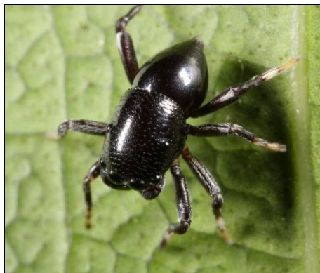
Male Coccorchestes ferreus (Salticidae) from Iron Range, far north Queensland.