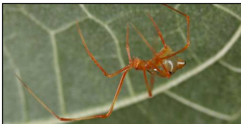
Myrmarachne sp. (Salticidae; top), Amyciaea albomaculata (Thomisidae; middle) and an undescribed Theridiidae sp. (bottom) from near Darwin (Northern Territory); all mimicking the tropical green tree ant Oecophylla smaragdina .