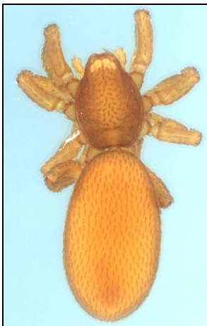
New genus of Oonopidae from Western Australia.

National Science Foundation (NSF) Planetary Biodiversity Inventory (PBI) Project: The Spider Family Oonopidae