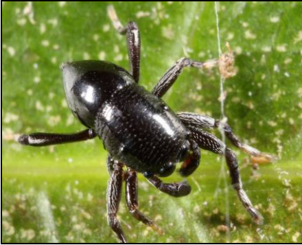
Male Coccorchestes ferreus (Salticidae) from Iron Range, far north Queensland.