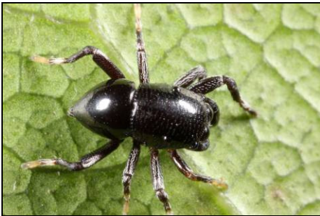
Male Coccorchestes ferreus (Salticidae) from Iron Range, far north Queensland.