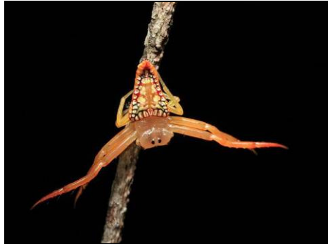
Figure 9. Arkys walckenaeri Simon, 1879 is a small to medium-sized ambush hunter on foliage, waiting with outstretched arms for insects and other arthropods to come within range. It has a longer, narrower abdomen than many other similar Arkys species. It is found throughout mainland Australia's east coast and hinterland, mostly in the southern states. The former name 'clavatus' means studded with nails, referring to the pattern on the abdomen. This specimen collected along the McCartins Track, North Foster, Gippsland.