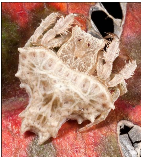
Figure 2. Arkys alatus Keyserling, 1890 is a small ambush hunter on foliage in all types of habitats with good rainfall from central Queensland to Victoria. It is a flattish spider with white, cream, dark-grey or brown overall colour and ornate patterns and knobs. The cephalothorax is just slightly longer than wide. The lateral eyes are on a projecting knob. The pattern on the abdomen can resemble a ghoulish looking skull or a spectral dog's head. The species name ' alatus ' means winged.

The following pictures and brief descriptions highlight just some of the members of this genus, remarkable for their complex shapes and brilliant colours.