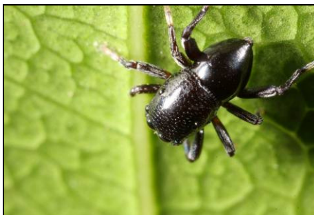
Male Coccorchestes ferreus (Salticidae) from Iron Range, far north Queensland.