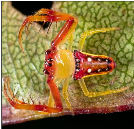
Figure 3. Arkys bulburinensis Heimer, 1984. The holotype for this species was collected and photographed by Raymond Mascord, seen in his 1980 field guide (plate 29.2 on page 77). This specimen collected October 2009 at Mapleton Falls National Park. Image by Greg Anderson.