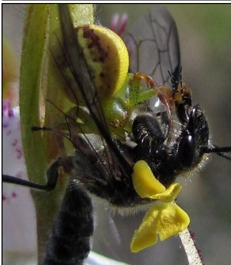
Crab spider (Thomisidae) with a male flower wasp on an orchid near Kojonup, Western Australia.