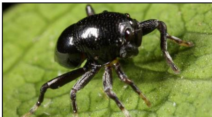
Male Coccorchestes ferreus (Salticidae) from Iron Range, far north Queensland.