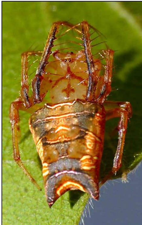
Figure 11. Arkys sp. 'Mascord's Pretty Arkys ' was recorded by Mascord in 1980 as an undescribed Archemorus species. He intended to name it ' A. pulcherrimus ', but never managed to publish a description. Body length of the female up to 8 mm, the male about 5 mm. The double pointed abdomen (somewhat like the tent-web spider Cyrtophora exanthematica ) and cross-like orange pattern on the cephalothorax are distinctive. Image by Robert Whyte.