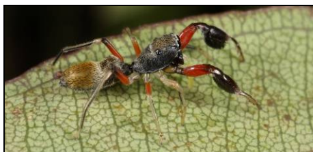
Female Ligonipes sp. (Salticidae) from near Sydney, New South Wales.