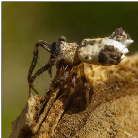
Figure 8. Arkys vicarius (Balogh, 1978) resembles A. dilatatus but the abdomen is constricted to a waist nearly halfway along, slightly closer to the leading edge. The colour is variable but seems always to have a bright white section across the rear and penetrating inwards along the upper surface of the abdomen.