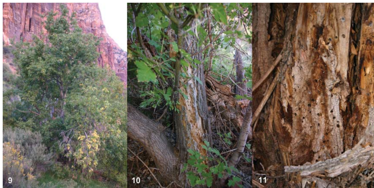
Figures 9–11. Box elder ( Acer negundo ) containing X. rameyi .

Jim Cope (pers. comm.) observed a female ascending a box elder tree trunk, ovipositing eggs singularly as she moved upward. Larvae have been collected along the entire length of the tree trunk [within this type of microhabitat].