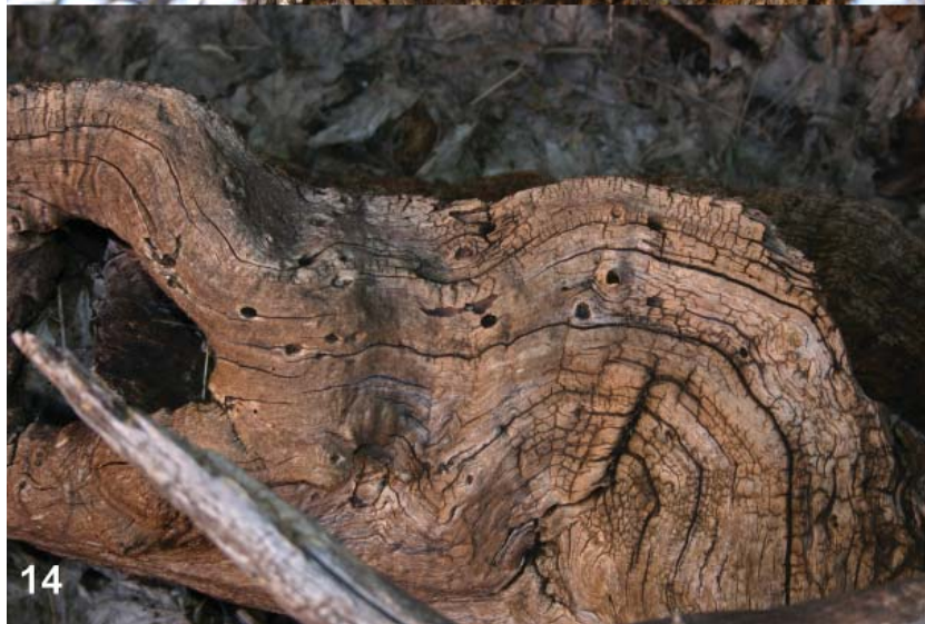
Figures 12–14. Gambel's oak ( Quercus gambelii ) containing X. rameyi .