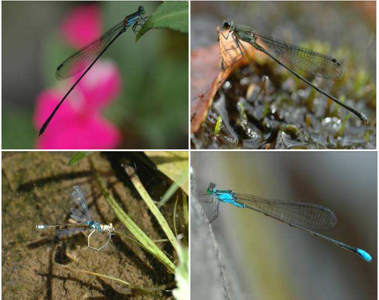
Figure 3: N. longistyla (left upper panel), I. heterosticta devouring N. erythroptera (left lower panel), N. comosa (right upper panel), and N. angulicollis (right lower panel). Photos have been reduced in quality.