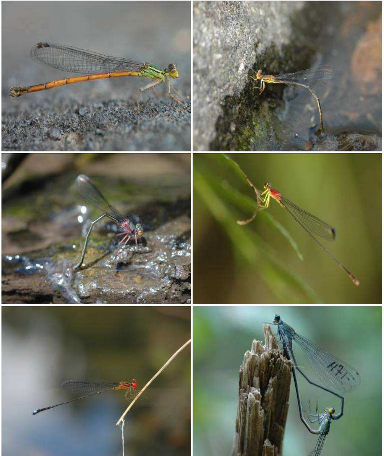
Figure 1: N. malcolmi (left upper panel), N. uds2 (left middle), N. erythroptera (left lower panel), N. rufostigma (right upper panel), N. brachycerca (right middle) and N. heteroneura (right lower panel). Photos have been reduced in quality.