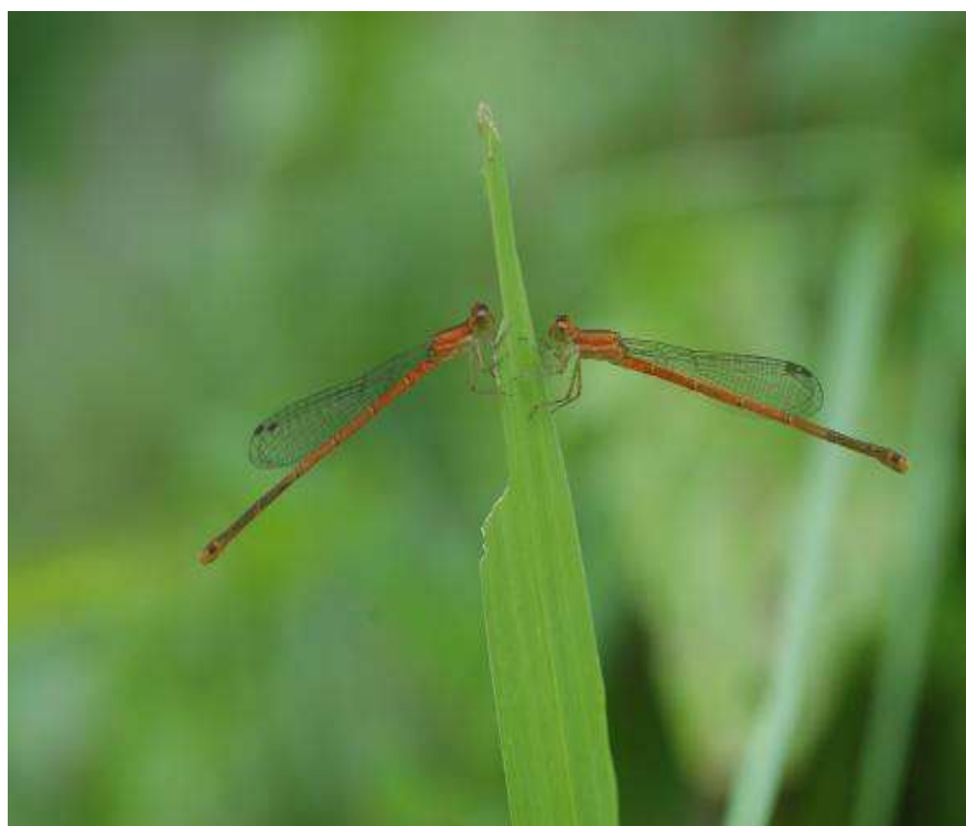
Agriocnemis exsudans

2 Department of Biology, Carleton University, 1125 Colonel By Drive, Ottawa, Ontario, K1S 5B6, Canada.