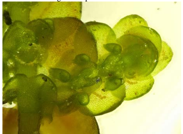
Fig. 10: Frullania tamarisci s.str. bluntly acuminate leaf tips, ocelli