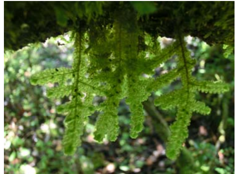
Fig. 6: Neckera cephalonica