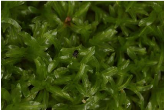
Fig. 7: Hydrogonium ehrenbergii