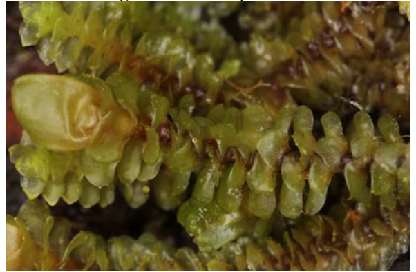
Fig. 8: Scapania scandica