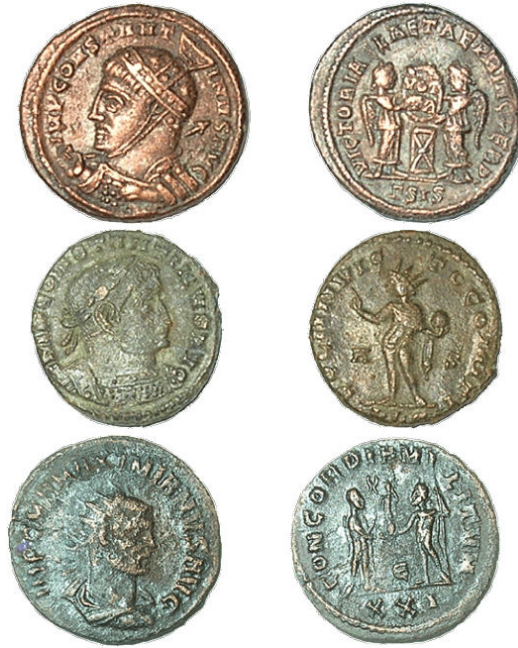
Figure 3. A selection of excavated coin finds from Yotvata, Israel. A.) folles of Constantine the Great, RIC VII (Siscia) 55; B.) folles of Constantine the Great, RIC VII (Lugdunum) 53; C.) folles of Maximian, RIC V.2 (Max. Herc.) 607.

Those who argue that proper archaeological sites do not produce large numbers of coins are simply unfamiliar with the scholarly literature. Many large hoards and thousands of single finds can be found at sites of varying sizes. Familiarization with the Fundmünzen inventories and similar publications will show that coin finds frequently are found in great numbers at civilian and military sites alike, as the numbers from Burghöfe illustrate. The idea that large hoards, devoid of any archaeological context associated with settlement-remains, satisfy collector and dealer demand is a fallacy; in fact, the selling practices of many coin dealers betray this notion. For example, when looking at bulk lots of coins on eBay and VCoins, one can read in the descriptions various disclaimers that there may be a mixture of Greek, Roman, Islamic, Medieval, or even modern coins in the lots; clearly, these are not the contents of an ancient hoard, which usually would have a much tighter chronological association, but rather the accumulation of coins robbed from multiple archaeological sites with different periods and ranges of occupation.