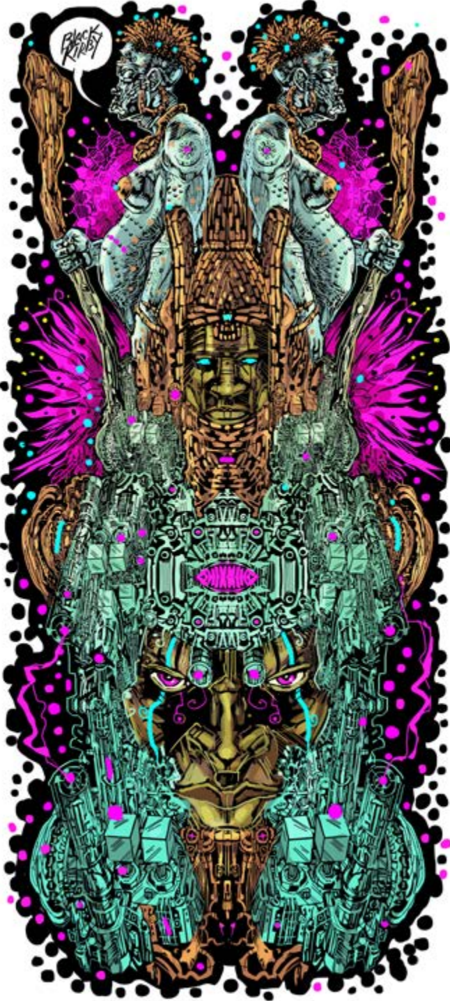
Fig. 4 Black Kirby: Funky Totem