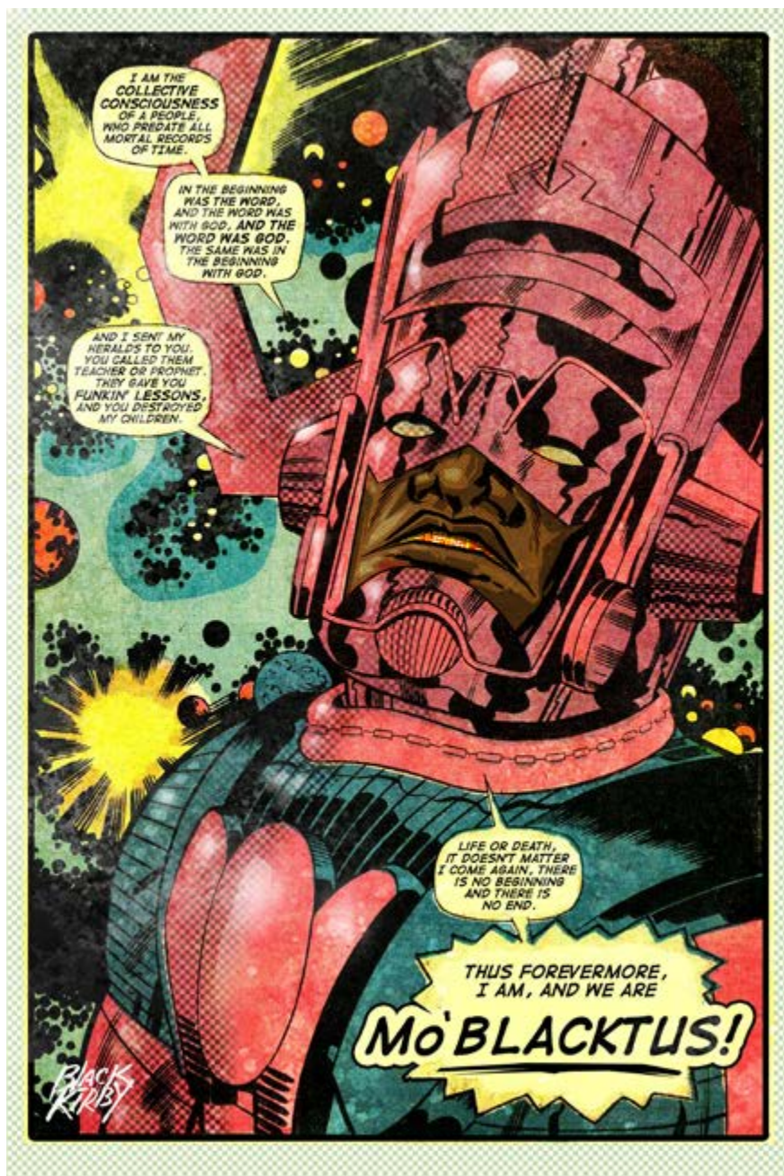
Fig. 3 Black Kirby: Mo'BLACKTUS