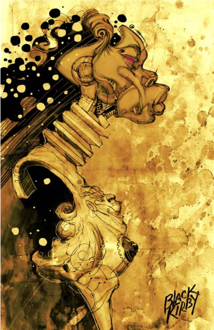
Fig. 1 Black Kirby: FIRST KONTAKT