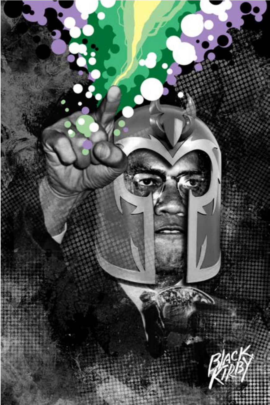
Fig. 5 Black Kirby: Magneto X