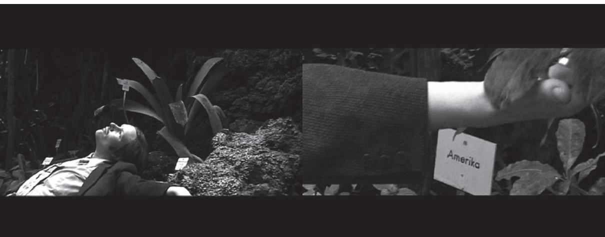
Fig. 5-6. Stills from Sometimes You Fight For the World, Sometimes You Fight For Yourself (Boudry/Lorenz 2004).