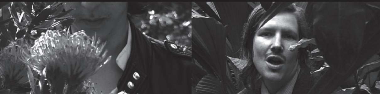
Fig. 1-4. Stills from Sometimes You Fight For the World, Sometimes You Fight For Yourself (Boudry/Lorenz 2004).

ritory. Additionally, the lyrics of the song expose the ongoing tradition of capitalist expansion and colonial respectively neo-colonial exploitation, building upon and worked into love relations. The ‘herstory’ presented does not leave a lot of hope for love, exactly because ‘history’ binds it to exploitation and domination. Yet desire is still virulent after the end of the duet: again an erotic exchange of gazes, supported by exhibitionist and voyeuristic practices, takes place – but does not have the effect that the protagonists come any closer. In the end the beholder is left with an assemblage of ant and plant and birds twitter.