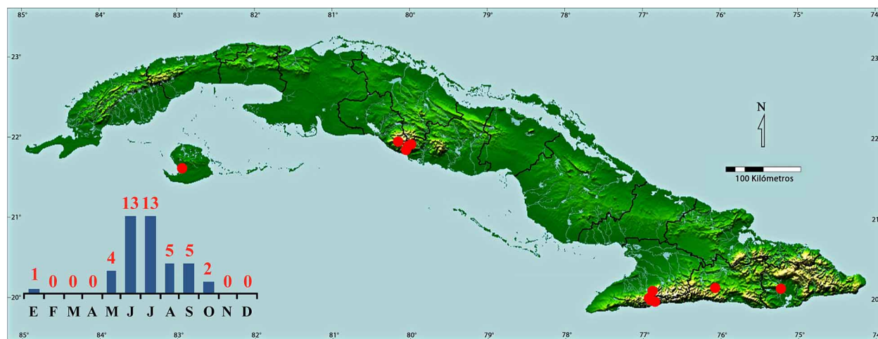
Figure 11. Geographical and spatial distribution of Trypanidius insularis Fisher, 1925, in Cuba.

Geographical distribution. Cuba, Hispaniola, Puerto Rico.